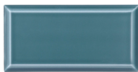
Teal 4"x8", 4"x12"