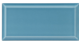
Light Blue 4"x8", 4"x12"