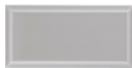
Grey 4"x8", 4"x12"