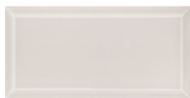
Beige 4"x8", 4"x12"