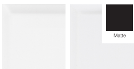
White / White Matte 3"x6", 4"x8", 4"x12"