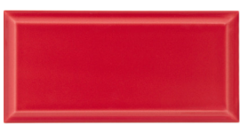
Red 4"x8", 4"x12"