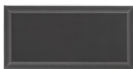
Dark Grey 4"x8", 4"x12"