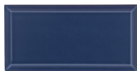
Blue 4"x8", 4"x12"