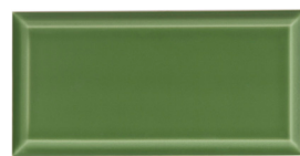
Green 4"x8", 4"x12"